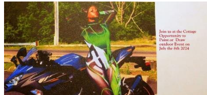
Join us at the Cottage Opportunity to Paint or Draw outdoor Event on July the 8th 2024

All classes take place at the Cottage, 700 Zucksville Road, Easton, PA 18040. Please contact Sharon at 610-252-6123 for more information or to reserve your space.